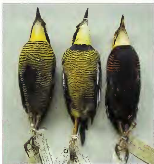
Plate 2. Banded Pitta males (ventral view): left to right, P. g. schwaneri, P. g. guajana and P. g. irena.